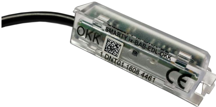
Figure 1: The SMARTY ix-BAB-EDL-OKK communication adapter for plug-in meters with EDL protocol